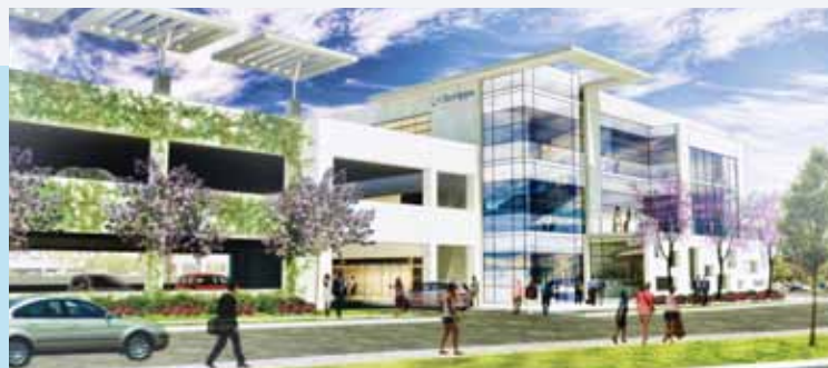
The new cancer center will be located in Hillcrest across from Scripps Mercy Hospital.

The environment will be designed to create a sense of wellness and comfort. Patient support services, including integrative medicine and palliative care, will be located here. And a serene, roof-top garden will provide a tranquil retreat.