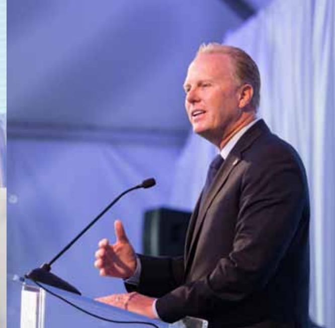
City of San Diego Mayor Kevin Faulconer tells guests at the new conference, "This is about making a difference in our patients' lives. It is an exciting day for San Diego and Southern California."