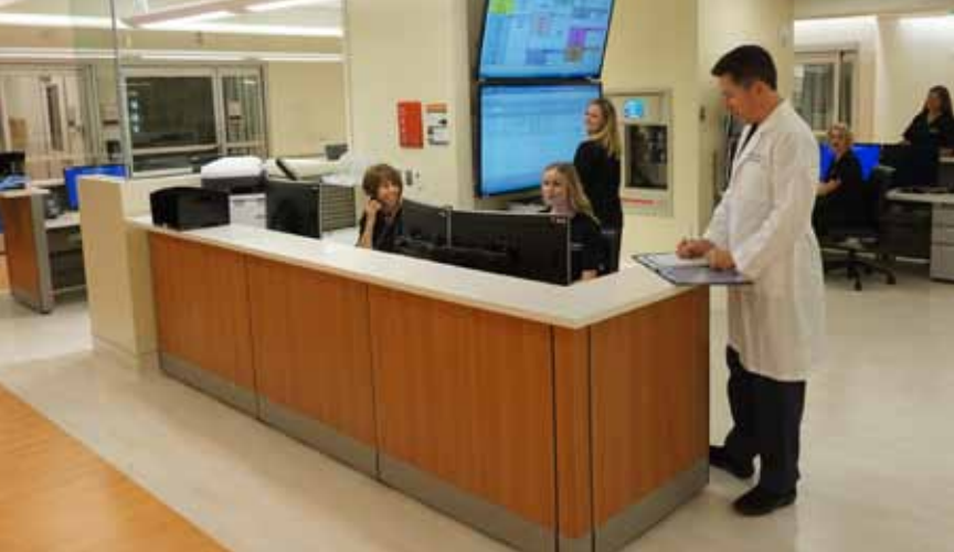
The new center is six times larger than the previous space and includes 51 private beds.