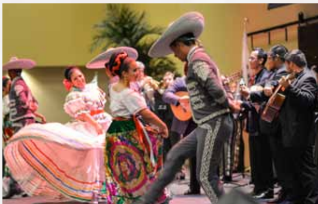
A lively finale of music and dancing capped the evening, filled with tributes, auctions and delicious food.